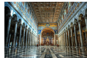
St. Paul's Outside the Walls