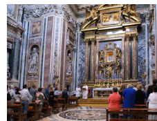
St. Mary Major where we will have Mass Ash Wed.

visit two very Lenten Churches, Rome's famous "Bone Church" to help us to reflect on the reality that we are dust and unto dust we shall return as well as to the beautiful Church of St. Praxedes, which houses part of the column on which Jesus was scourged. Our one main meal of the day will take place at night as we get Lent off to a truly prayer, papal, Marian and great start!