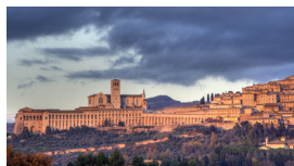
St. Francis Basilica in Assisi

getting our bags, we will board the deluxe motor coach and head first to Orvieto, the picturesque mountain-top shrine where the Eucharistic miracle that gave rise to the feast of Corpus Christi is enshrined. We will have Mass, visit the beautiful cathedral and have lunch. From there we will head to Assisi to check in to our hotel and have dinner.