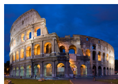
The Colosseum at Night

visit two very Lenten Churches, Rome's famous "Bone Church" to help us to reflect on the reality that we are dust and unto dust we shall return as well as to the beautiful Church of St. Praxedes, which houses part of the column on which Jesus was scourged. Our one main meal of the day will take place at night as we get Lent off to a truly prayer, papal, Marian and great start!