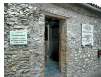
St. Pio's Birthplace

After freshening up, we will have a Mardi Gras dinner. Wednesday, February 18, Rome: We will begin Ash Wednesday with a spartan breakfast at the hotel, before heading to St. Peter's Square for the general audience with Pope Francis. What a way to begin Lent! After lunch on our own, we will head in the afternoon to St. Mary Major for Ash Wednesday Mass. We will also