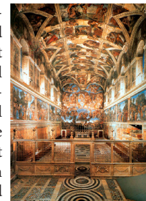
The Sistine Chapel

Saturday, February 21, Rome, Boston, Home: After an optional morning Mass in our hotel and breakfast, we will load the bus and head to the airport for our 10:15 am flight back to the United States, where we will connect in Atlanta and arrive back in Boston at 8:25 pm. From there we will travel by motorcoach back to Fall River where we will finish the pilgrimage with a short visit in the Chapel and then continue our Lenten pilgrimage and pilgrimage strengthened and energized for the journey!