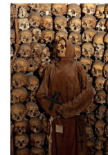
The Bone Church

Thursday, February 19, Rome – After breakfast in the hotel, we will take the bus to the Pope's Cathedral, St. John Lateran Archbasilica, for Mass and a visit. We will also visit St. John Lateran's ancient and famous baptistry, the Scala Sancta containing the staircase from Pontius Pilate's Praetorium that St. Helen brought to Rome and on which we believe Jesus would have been on Good Friday, and the Church of Holy Cross in Jerusalem, containing the relics of the Passion (a part of the crown of thorns, Christ's Cross' title plate, one of the nails that pierced him, a part of the column of scourging and more). After a light lunch on our own, we will visit the catacombs. On the way back, we will stop to visit the Colosseum and forum of ancient Rome. We will have dinner as a group in the evening.