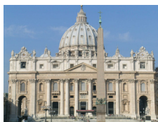
Practically the view from our hotel!

Monday, February 16, Monte Sant'Angelo, Pictrelcina, Monte Cassino, Anzio and Rome – After breakfast in our hotel and loading the bus, we will head to the beautiful town of Pictrelcina, the birthplace of St. Padre Pio, for Mass. Then we will head to the famous Benedictine Monastery of Monte Cassino, where St. Benedict and St. Scholastica are buried. A light lunch will be on our own. Next we will head to Anzio and visit the tomb of the 11 year old 1902 martyr and patron of purity, St. Maria Goretti and visit the American National Cemetery. Finally we will head to Rome to check into our hotel and sit down for a great dinner.