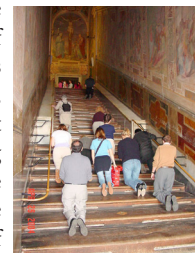
The Holy Stairs

Thursday, February 19, Rome – After breakfast in the hotel, we will take the bus to the Pope's Cathedral, St. John Lateran Archbasilica, for Mass and a visit. We will also visit St. John Lateran's ancient and famous baptistry, the Scala Sancta containing the staircase from Pontius Pilate's Praetorium that St. Helen brought to Rome and on which we believe Jesus would have been on Good Friday, and the Church of Holy Cross in Jerusalem, containing the relics of the Passion (a part of the crown of thorns, Christ's Cross' title plate, one of the nails that pierced him, a part of the column of scourging and more). After a light lunch on our own, we will visit the catacombs. On the way back, we will stop to visit the Colosseum and forum of ancient Rome. We will have dinner as a group in the evening.