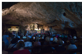
St. Michael's Cave

Saturday, February 14, Assisi, Loreto, Lanciano and Monte Sant'Angelo: After breakfast at the hotel and getting our stuff on the bus, we will head out to Loreto, the famous Marian shrine where there is special devotion to the Holy House of Nazareth, transported to Loreto in the 13th century. We will have Mass. Light lunch on our own for those interested. From there we will head to Lanciano, the site of the greatest Eucharistic miracle of all time (8th