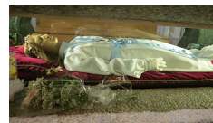
St. Maria Goretti