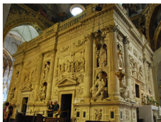
Holy House in Loreto

Friday, February 13, Assisi: After breakfast in the Hotel, we will spend the entire day in Assisi, walking in the footsteps of St. Francis. We will have Mass in the Basilica built over his tomb and visit all the shrines associated with his life and the life of St. Claire. Lunch is on our own. A sumptuous dinner included.